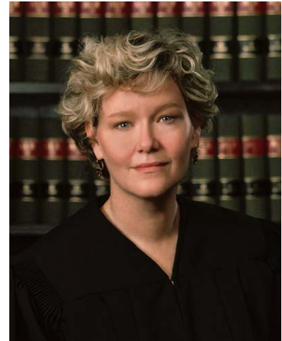
Judge Deneise Turner Lott

Claimant's counsel should file the PHS at the end of the 120-day discovery period, although the PHS may be filed as early as 60 days after the employer/carrier files an Answer with the Commission. Either party may request in writing that the 120-day discovery period be extended for good cause shown. Whether claimant files the PHS on the 60th or the 120th day, employer's PHS is due within 15 days after claimant files a PHS.