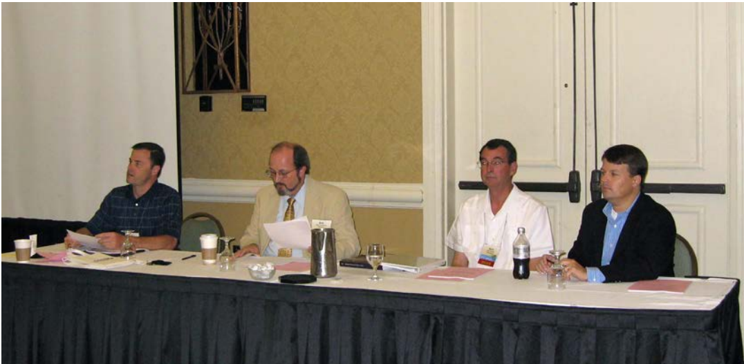
Presenters at the joint presentation of the Business Law and Health Law Sections of the Mississippi Bar at the 2011 Summer School for Lawyers.