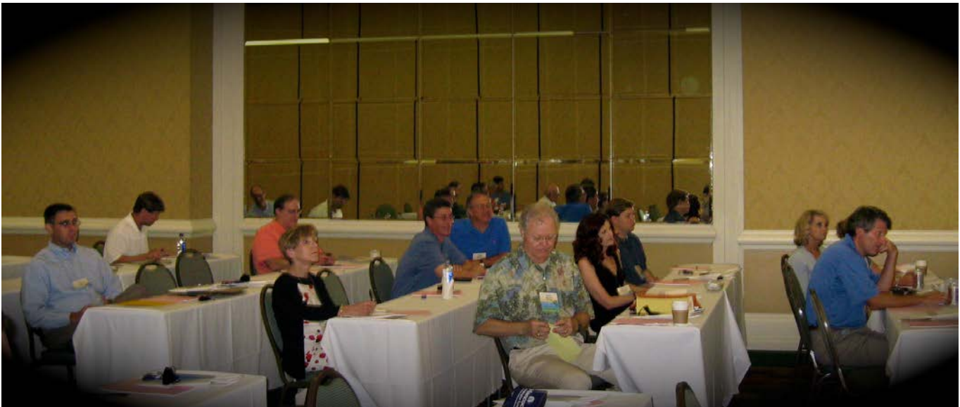
Attendees of the joint presentation of the Business Law and Health Law Sections of the Mississippi Bar at the 2011 Summer School for Lawyers.