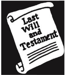
Estates & Trusts

Supreme Court Courthouse - 450 High Street - Jackson